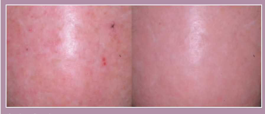
Caption – Russel