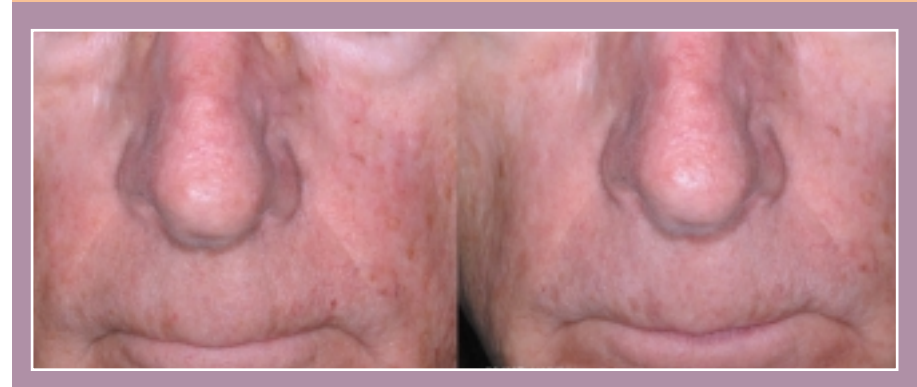
Caption - RAB